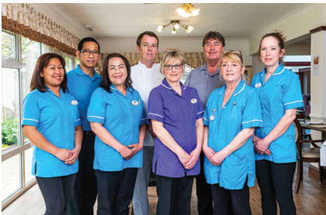
Oakland Court team

We continuously invest in training to support a quality of care in which we can all feel proud and meets the needs and expectations of our residents and their families.