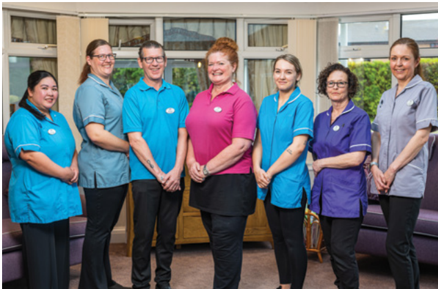
Oakland Grange team